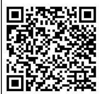
Directions for entering course requests in SchooLinks

After completing the worksheet, please see the next steps on how to enter courses in Course Planner in SchooLinks.